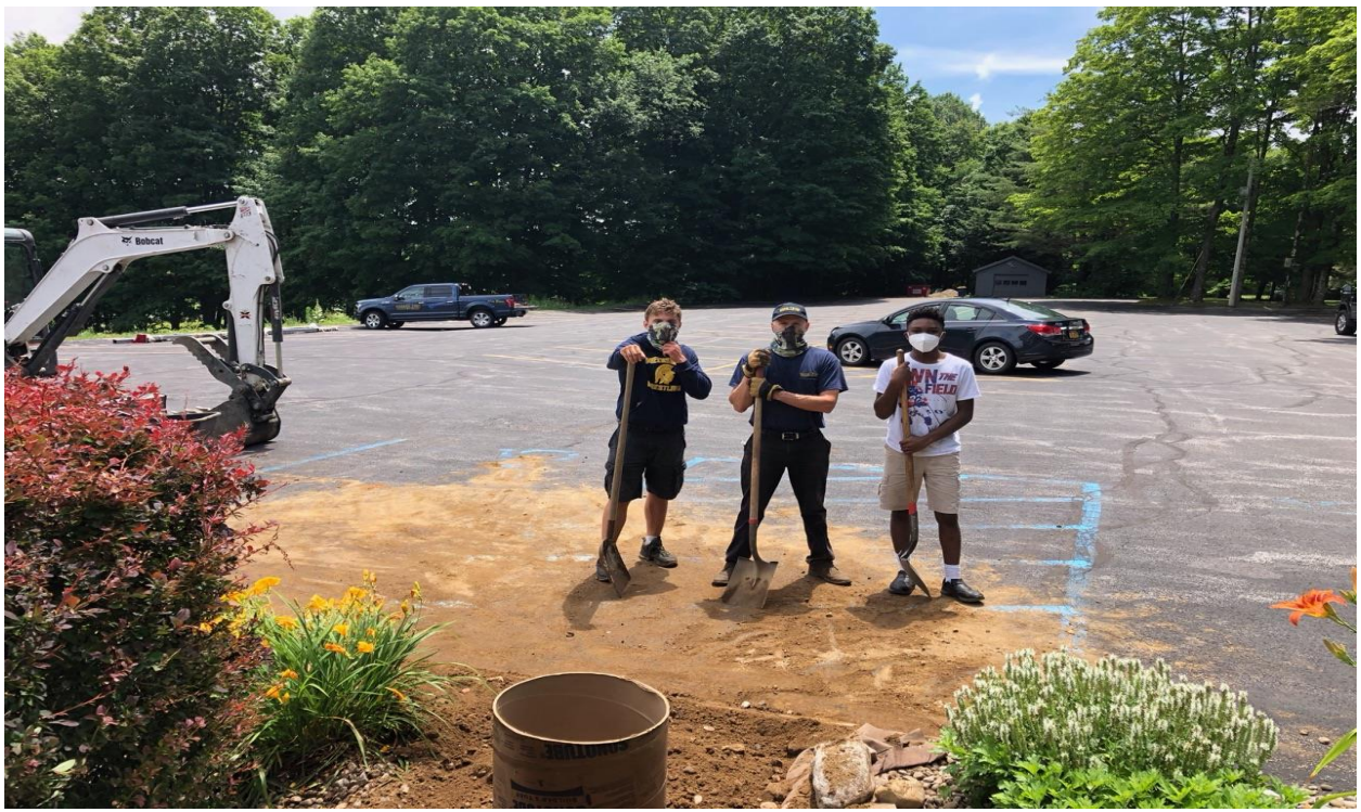
OOPS! I MISSED THE REST OF THE CREW...