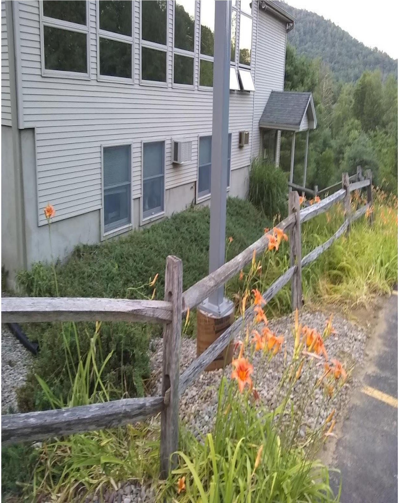
MORE WEEDING AND FENCE REPAIR